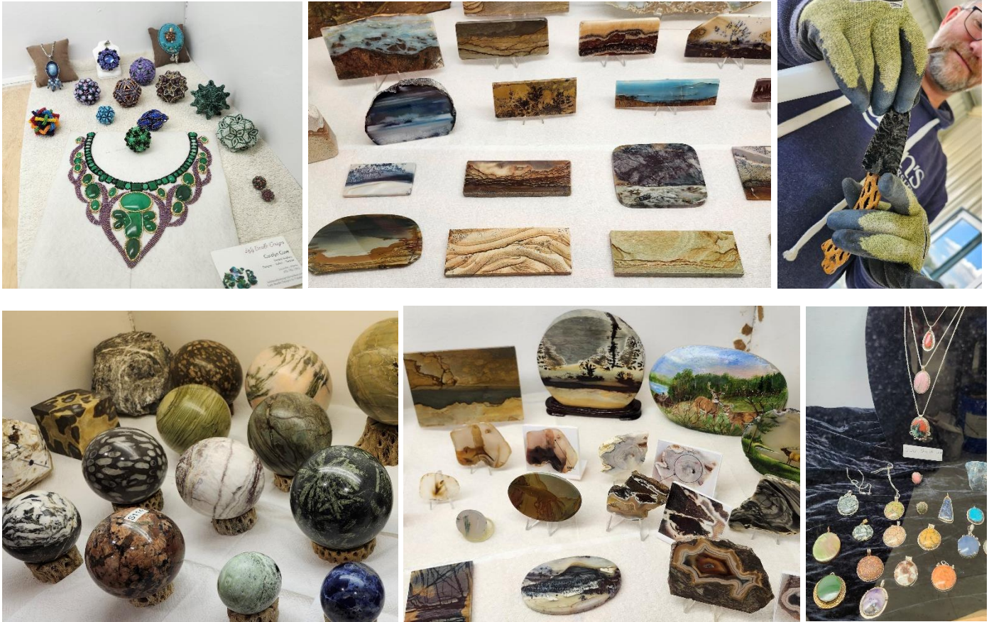
Some of the many kinds of lapidary creations exhibited by the participants of the May Daze 2024 event in Edmonton.