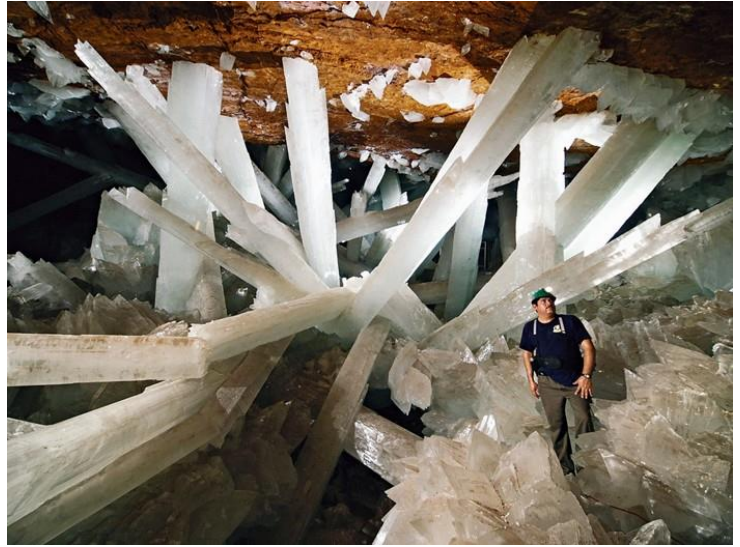
Large selenite crystals in the Cave of Crystals.

The Cave of Swords was discovered in 1910 by miners working in the Naica Mine, a site primarily known for its silver, lead, and zinc deposits. The Cave of Crystals was discovered in 2000. Two other caves were also discovered in 2000, named the Queen's Eye Cave and the Candles Cave. In 2009, yet another chamber was found while drilling and was named the Ice Palace.